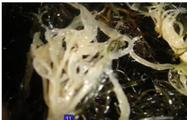
Figure 1. Ice-ice infected G. verrucosa .

Isolation, identification and pathogenicity test of bacteria. Ice-ice infected G. verrucosa thallus were collected from farms in Takalar Regency, 35 miles south of Makassar City, Indonesia. The symptoms of ice-ice disease, such as changes in thallus colour and texture (Figure 1) have been widely described (Lobban & Harrison 1994; Lundsor 2001; Directorate General of Aquaculture 2004).