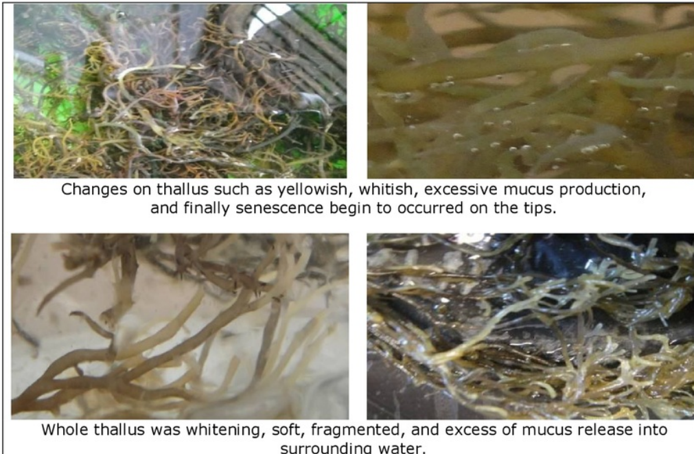
Figure 2. Condition and colour changes in G. verrucosa thalli due to ice-ice in the controls (without C. racemosa extract treatment).

Chlorophyll a content as a proportion of biomass increased from 0.028%-0.030% at the beginning of the experiment to 0.05% up to 0.104% at the end of the experiment in the G. verrucosa thalli soaked in C. racemosa extract. However in the control, chlorophyll a content initially increased only from 0.028% up to 0.05%.